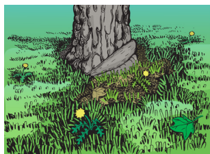
Girdling root as tree matures

The diameter of the root ball should be at least 10 to 12 times the diameter of the trunk as measured six inches (15 cm) above the trunk flare.