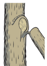
Incorrect pruning cut: branch collar injury

Incorrect pruning cuts on the main trunk are major problems. Cuts that remove or injure the swollen collar at the base of branches may lead to problems, such as canker formation, decay, and cracking. Incorrect pruning practices that leave a stub prevent a tree from recovering from the cut.